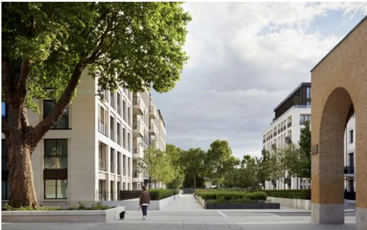
9 MULBERRY COURT CHELSEA BARRACKS