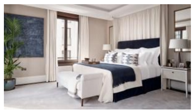
Inside a primary bedroom at Chelsea Barracks.

A further peek inside grants views of a culinary garden designed by Gustafson Porter as well as Garrison Square, which offers access to nearby alfresco dining and exhibition spaces. Chelsea Barracks claims its next phase will allow it to offer a total of 97 new residences across all three structures.