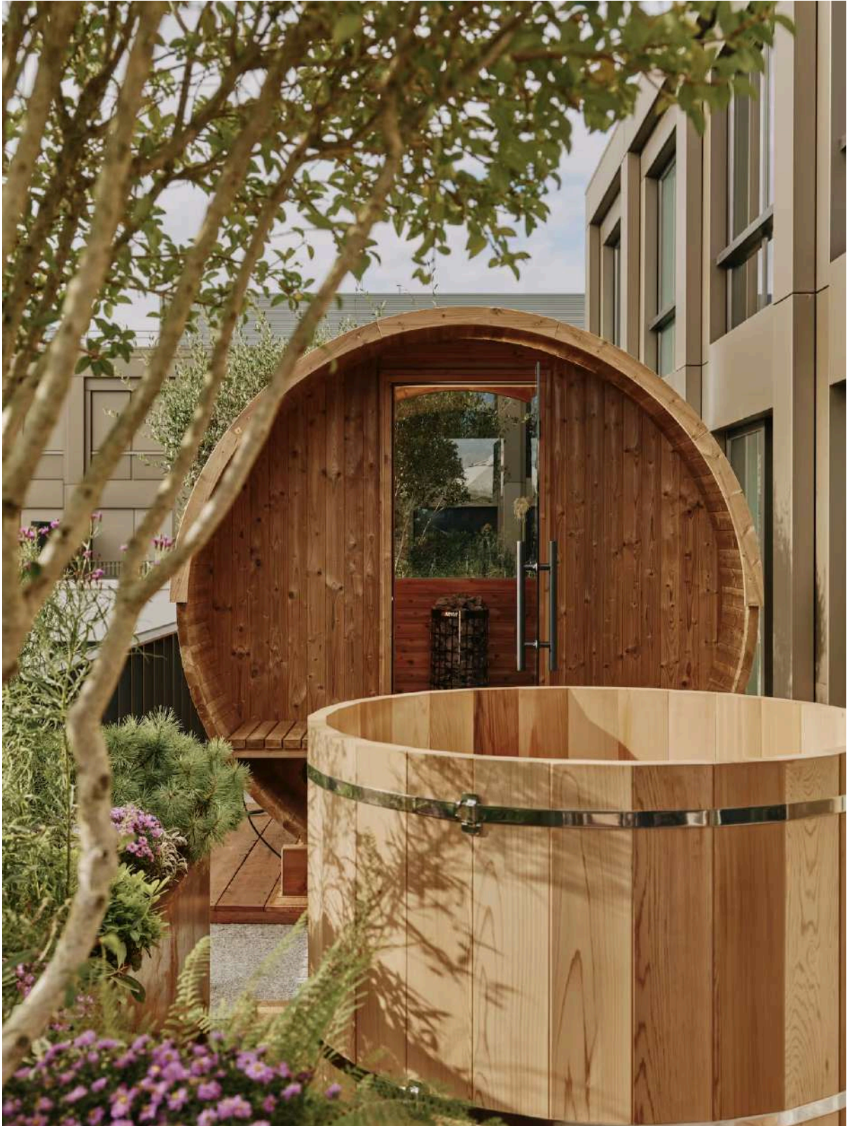
The space was "carefully zoned" to become an outdoor resort of sorts, according to the news release, with a redwood barrel sauna and ice bath.