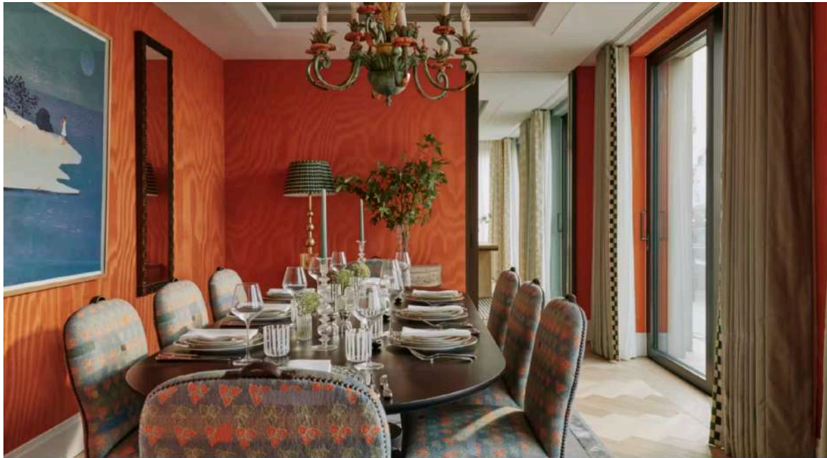
But the organic feel and finishes are contrasted by bolder choices in other rooms, like shimmering orange wallpaper in the dining room. CHRIS HORWOOD

The crowning unit in one of London's most storied developments is now on the market asking £44 million (US$56 million).