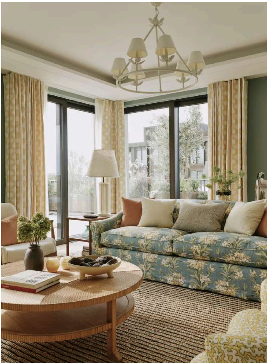
Botanical upholstery and sage green walls in the living room

She said she had been “greatly inspired by the significant outdoor terrace” of the penthouse and aimed to “bring the outside in.”