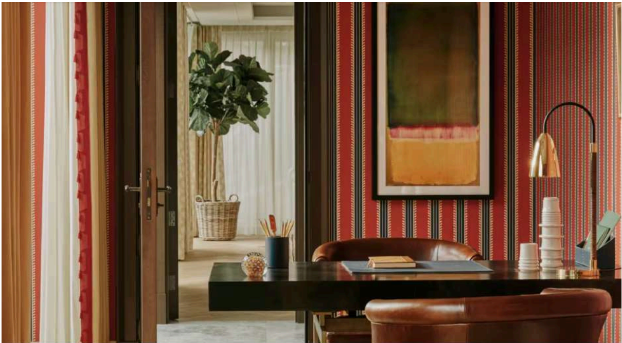
Chelsea Barracks is a historic site turned luxury development, designed to marry its original Georgian architecture with contemporary additions.