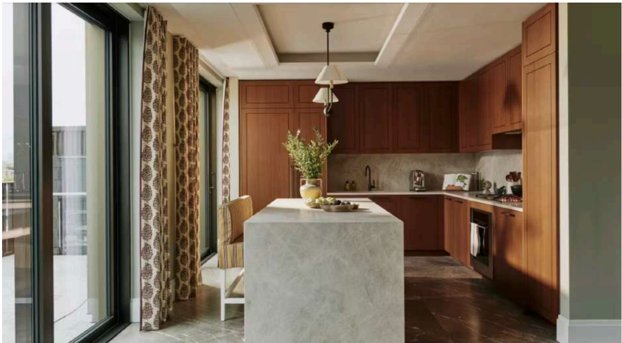
A marble slab island in the kitchen adds a hint of edge to the design. CHRIS HORWOOD