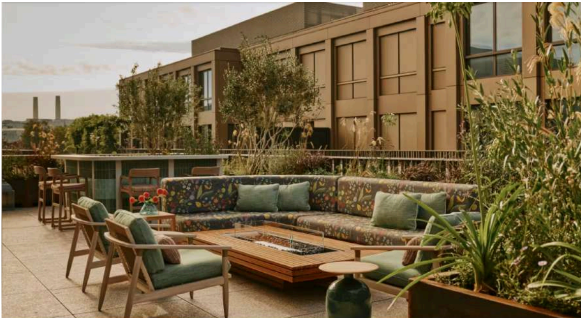
A further 3,584 square feet make up its amenity-packed wrap-around terrace. CHRIS HORWOOD